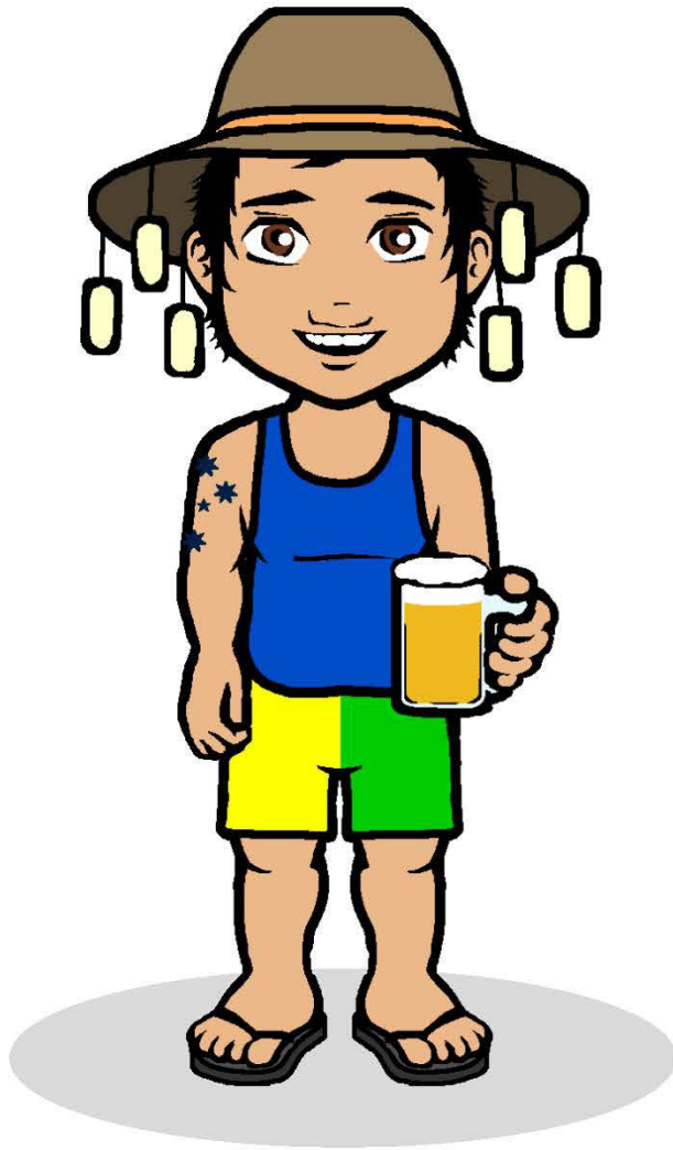
HOW I SEE MYSELF